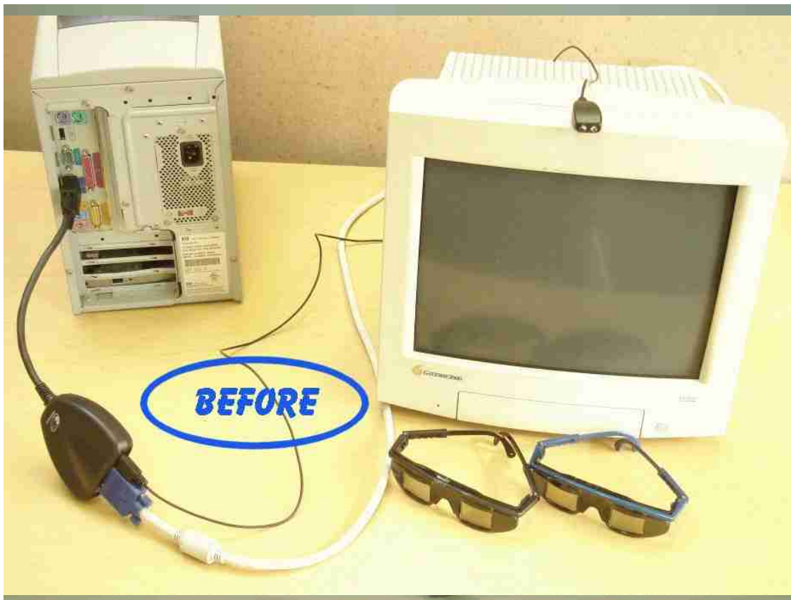
BEFORE installation of 3D-1002

3D Flight Simulation's STEREO PROJECTION EMITTER attaches to eDimensional's video adapter "dongle" and replaces the eDimensional IR emitter.