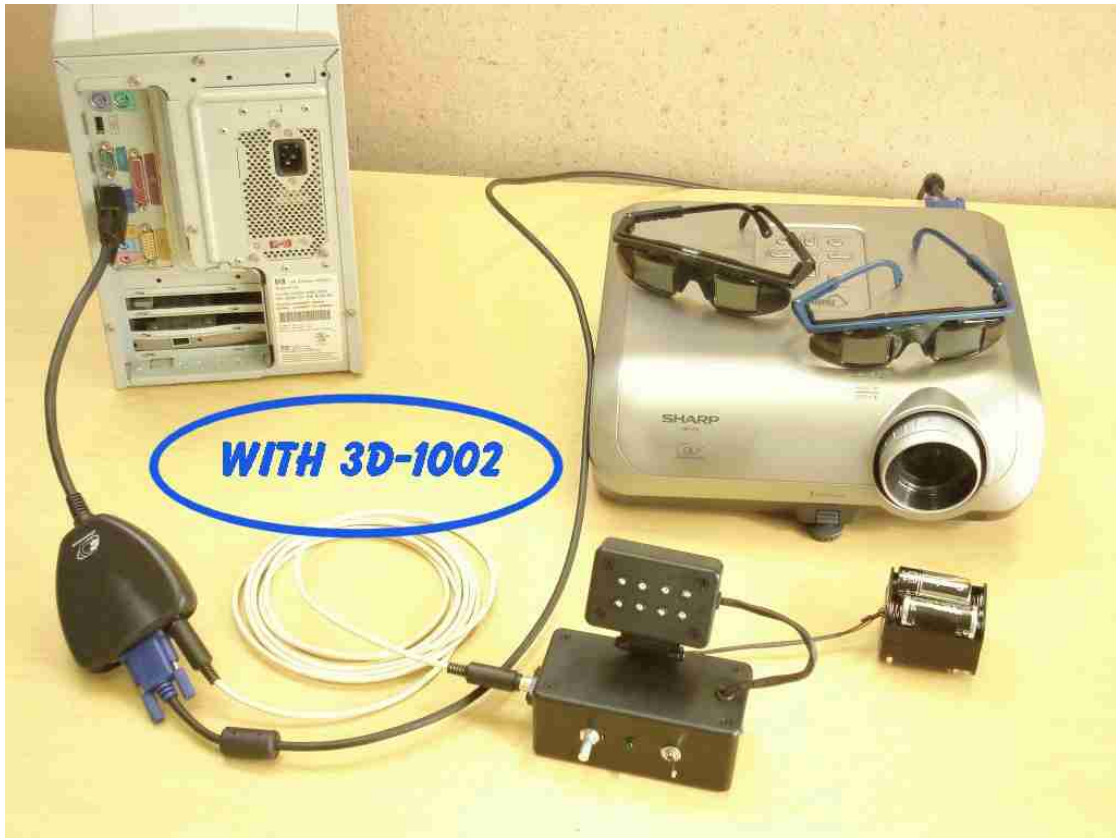
INSTALLATION OF 3D-1002